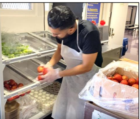
Other items, such as heavier whole fruit, will need to be loaded directly into the bins.