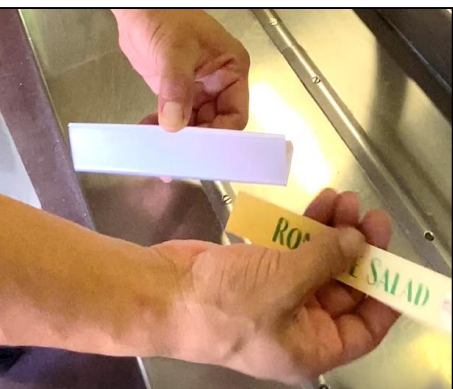
Insert name tag of items into sign holder. Reattach sign holder after inserting name tag.