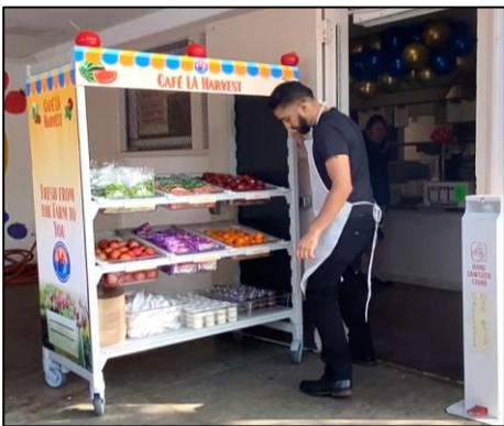
Position Harvest Bar at start of lunch line. Students should select from Harvest Bar before other offered lunch items.