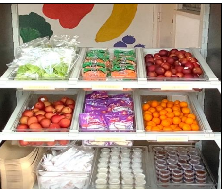
Set up Harvest Bar so that it is visually appealing. Place more popular items on bottom shelf for ease of access to smaller students.