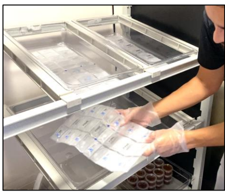
Insert frozen ice blankets into clear bins before placing pre-cut fruits and/or vegetables. Not required for whole fruit.