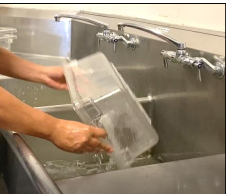
At end of service, clean bins, using the wash, rinse and sanitize procedure and let air dry for next day service.