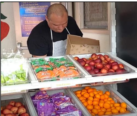
If available, restock items from back of Harvest Bar. There is no need to interrupt service to restock if the back of harvest bar is accessible.